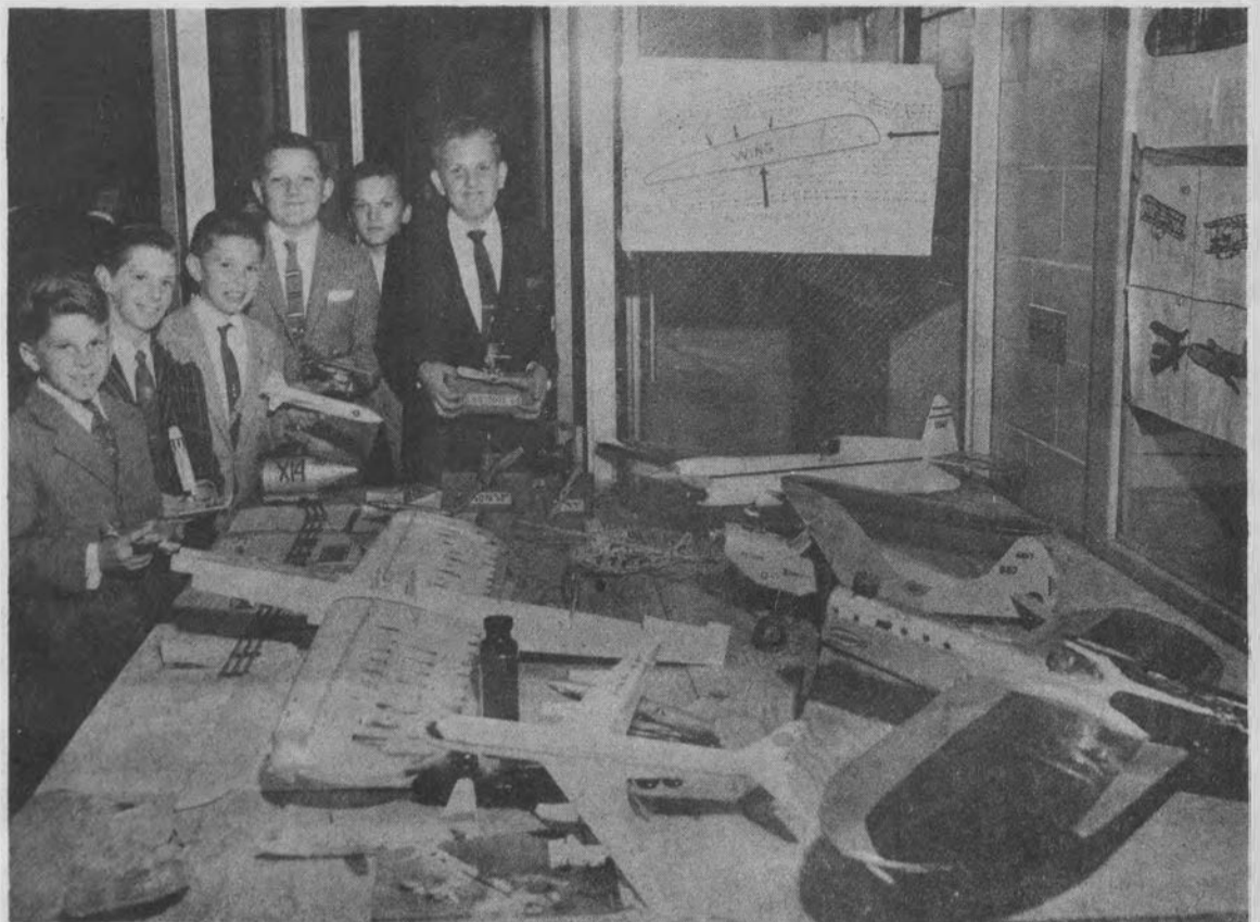
HI-HO! They Came to The Fair:- Sixth Grade Students at the Memorial School look over some of the displays at the Science Fair held recently

Following the meeting refreshments were served.