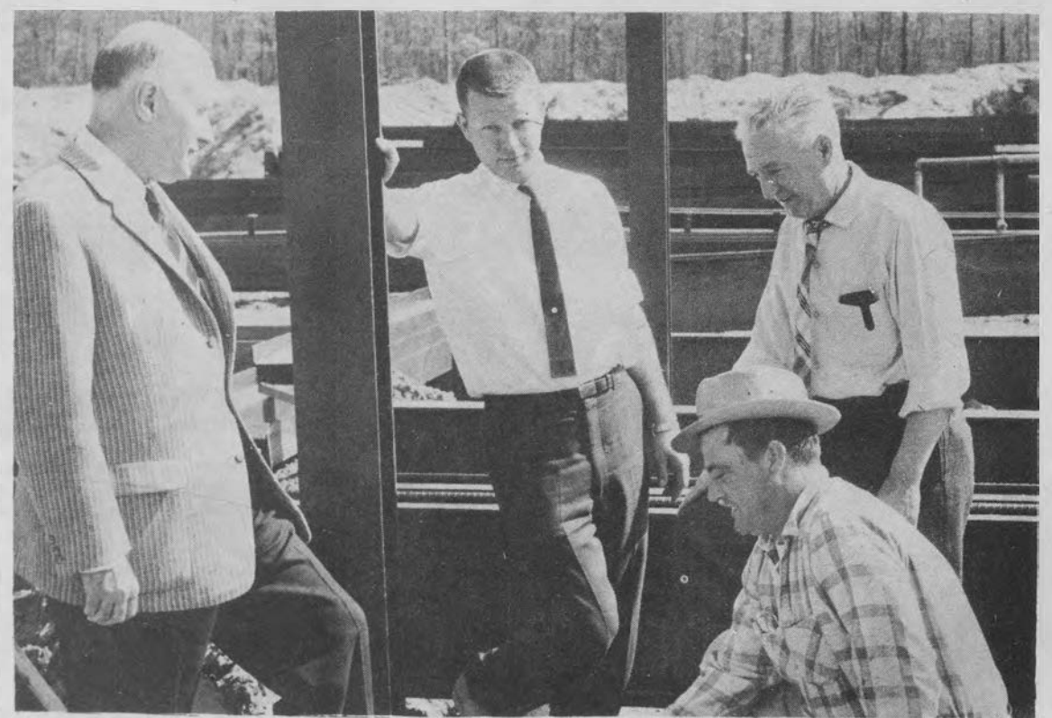
GOING UP: Steel for the Madison Township High School rapidly being erected by steelworkers. The $2,000,000, High School is expected to be ready for occupancy by September, 1961. High School receiving districts are balking at taking any more of

The speaker traced his career from criminal investigator in the Pennsylvania State Police to the White House in Washington, D.C., where he was a secret service man for six years. During that period he was present at the